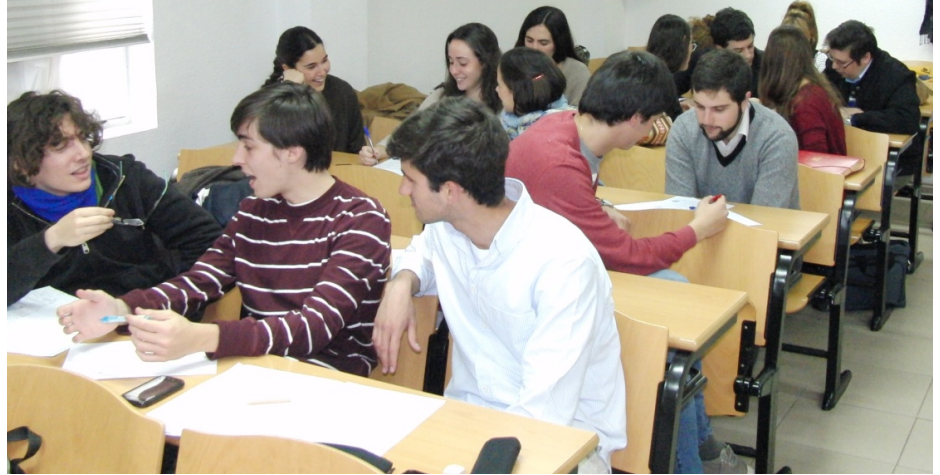
Figure 2. Students argue their answers in the group phase.

Later, the professor downloads the answers of the students and, after paying attention to one or two questions in which there is a major difference of opinions, he joins the students who answered different in groups of three or four members. Such approach to compose groups has the purpose of promoting the dialogue as much as possible. Sometimes it is difficult to join four students who have different answers. Nevertheless, the teacher never gathers students whose answers were the same. This process takes approximately five minutes, due to the fact that the answers should be downloaded in a spreadsheet and ordered according to the response. The students argue their answers during twenty minutes in the groups ( Figure 2 ).