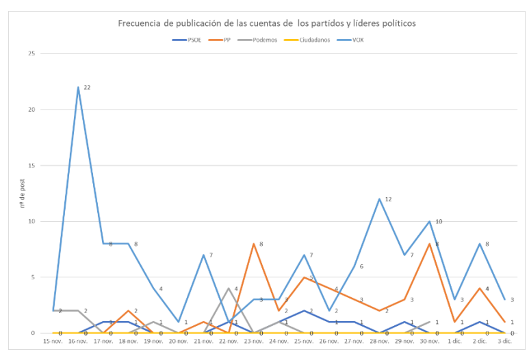
Chart 2: Publication Frequency from Political Parties

As for the frequency of publication, all parties had a downward trend as the end of the election campaign approaches, even though parties such as PP or Podemos, even PSOE, show peaks of publications at specific times not matching neither the start nor end of the campaign.