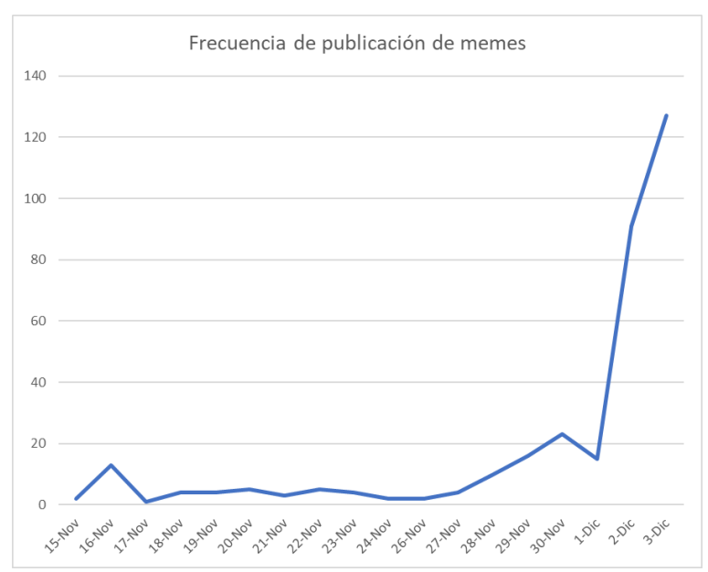
Chart 4: Publication Frequency of Memes

The publication of memes increased in frequency at the beginning of the election campaign and, above all, on Election Day and after. Memes were used to express joy at victory or defeat of the opponent or, on the other hand, to express sadness at defeat and bad wishes to the victor.