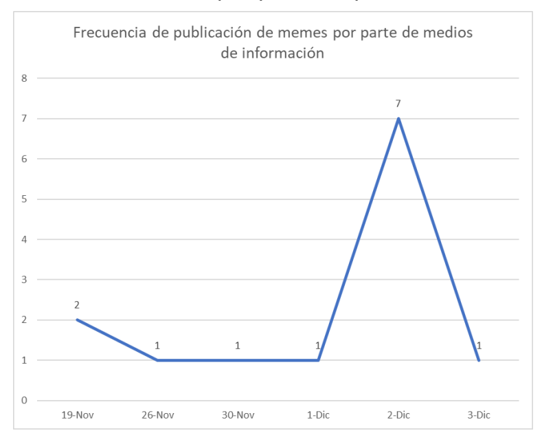
Chart 5: Publication Frequency of Memes by Information Media

When the volume and frequency of the memes were analyzed by information professionals, it was discovered that no journalist from their individual public account contained any in this format. However, from their corporate Instagram accounts, the media did post memes, especially on Election Day (7). This increase in the number of published memes corresponds to the overall increase in the number of publications on Election Day, as mentioned above.